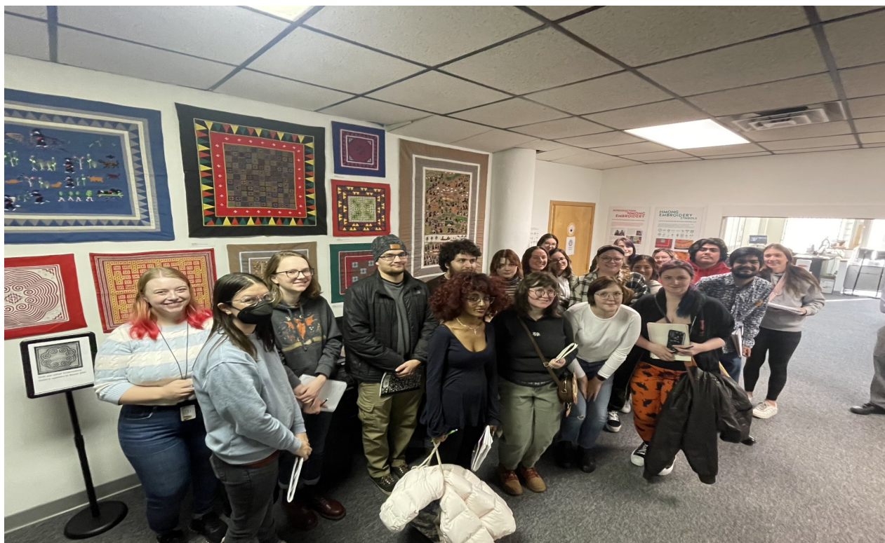
A college class tours the Hmong Cultural Center Museum