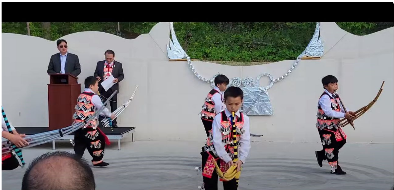
HCC's Qeej Troupe Performs at Lake Phalen